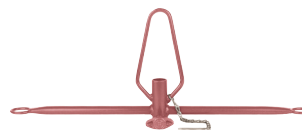
Type 42596 Trapeze