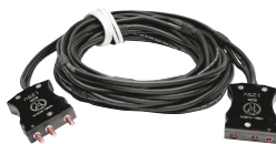
Type 5001301 25 FT. 100 Amp Extension Cable