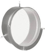
Type 24637 Diffuser Holder with Type 34717 Safety Screen

Globes are not included in price of lamp. See price list for complete details.